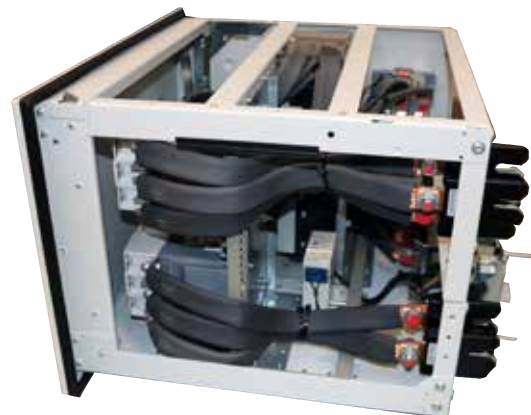
Connection: Between electrical components.