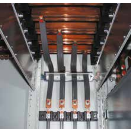
Connection: Busbar to busbar

A Cu-flex copper busbar is made of copper wires that are woven to create a flexible busbar. CUBIC's patented technique forges the ends of the busbar into a solid unit. Thus obtaining a contact surface that makes it possible to produce maintenance-free connections. No tin or the like has been added.